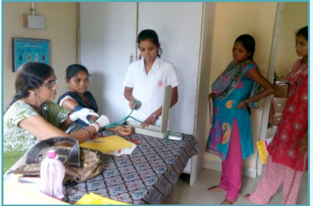
Health Check-up under SNGO Project