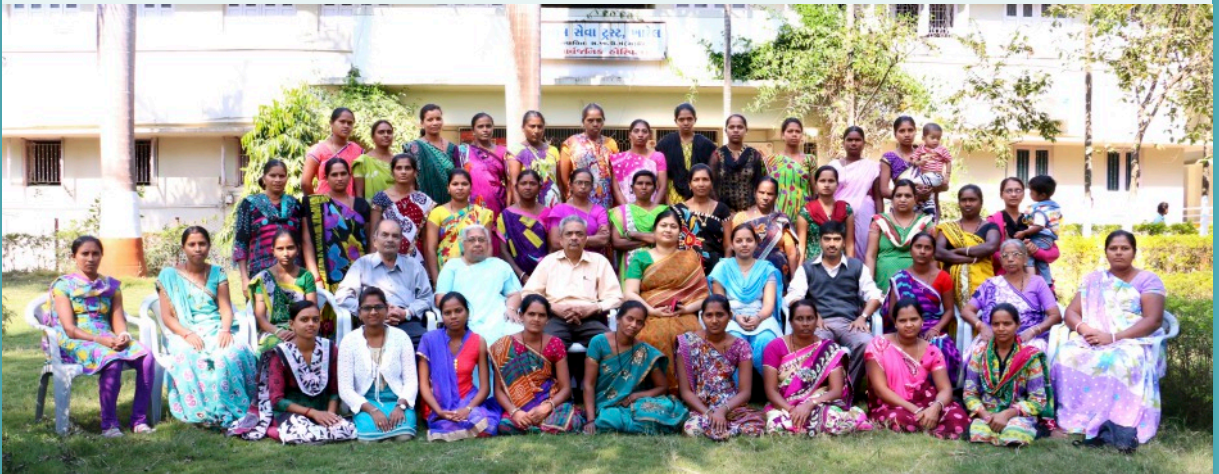
Community Outreach Staff