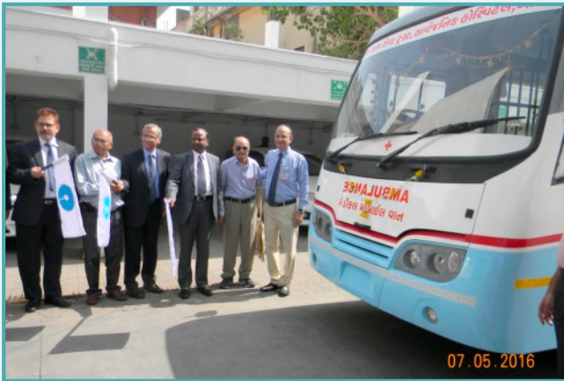
Donation of Medical Mobile Van by SBI