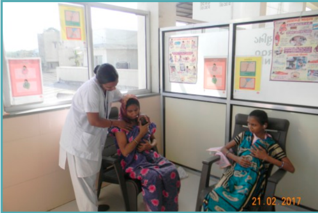
Kangaroo Care Unit