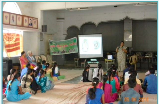
Newly Married Couples Workshop