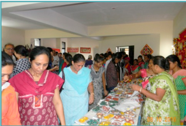
Exhibition cum Sale of Handicrafts