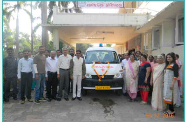
Donation of Ambulance by Donor