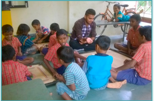
Our "Parodh" Balawas children enjoying their games